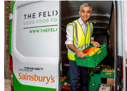
A targeted campaign to tackle food waste and food poverty.