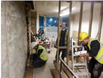
A six-month construction skills course for homeless people.

We are able to reach causes which are often not known to the general public. By supporting these groups, we are in turn helping our supporters to achieve enormous impact locally.